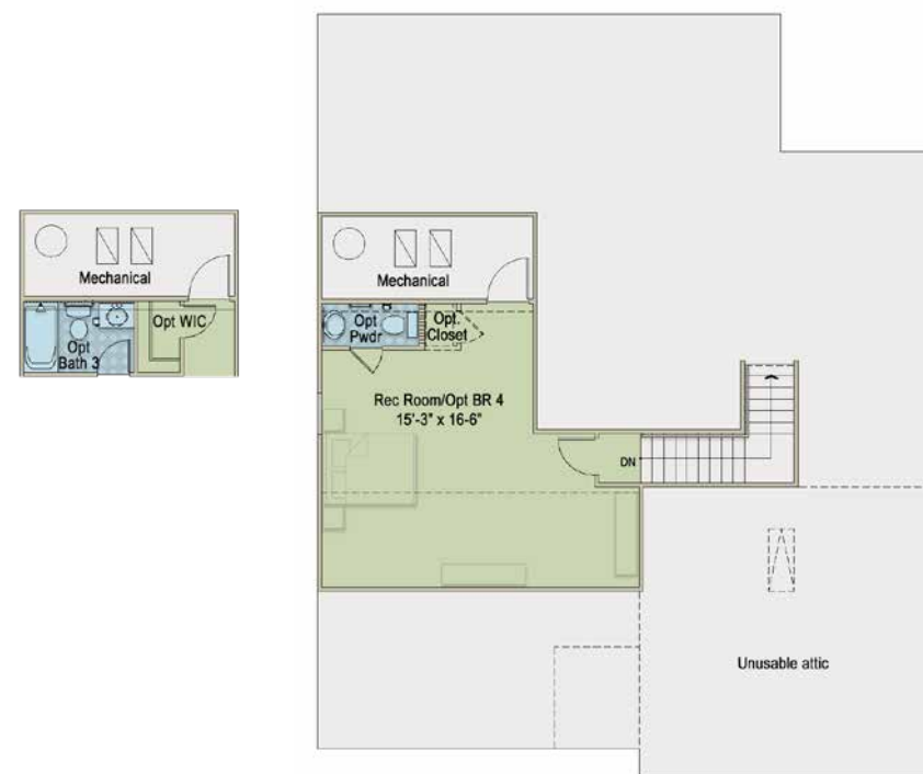
2 ND FLOOR REC ROOM OR BEDROOM #4 ~2,297 SQUARE FEET W/ BASEMENT ~3,503 SQUARE FEET