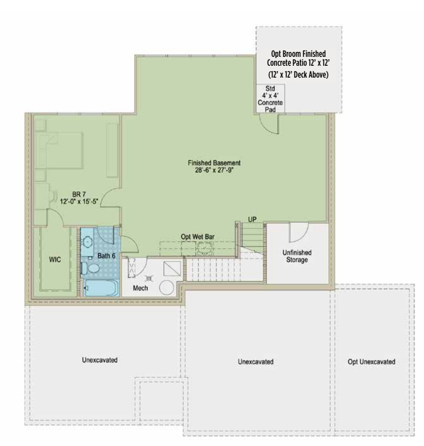
BASEMENT ~1,125 SQUARE FEET