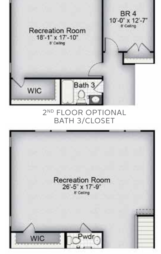
2<sup>ND</sup> FLOOR OPTIONAL POWDER BATH/CLOSET